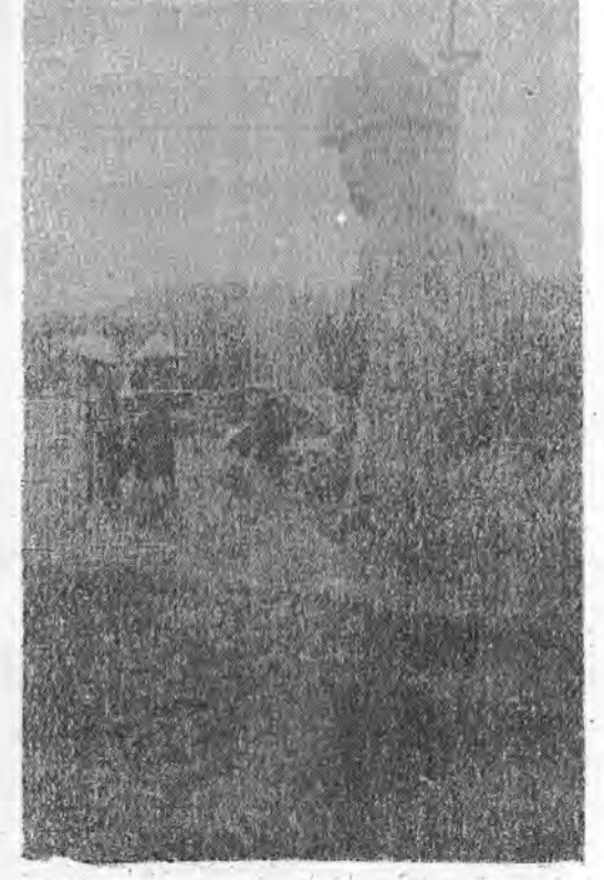
RICE 'GUARD-A lone "Brave" from the 3rd Battalion, 12th Infantry watches over one of the many rice fields guarded by Ivymen during the rice harvest protection phases of Operation Adams. The infantrymen secured the fields while refugees in Tuy An District came in and picked the grains.